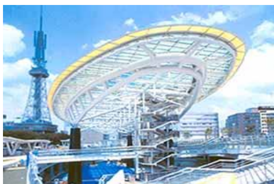
Oasis 21

B : All right. In fact, I went there last Sunday. The symbol of OASIS 21 is a structure called a water spaceship. We can enjoy a harmony of light and water there. Moreover, there are nice restaurants and shops below the spaceship, open until very late. This building is also used as a bus terminal. This place is very popular among young people. OASIS 21 is a modern and multipurpose park, and is worth visiting!