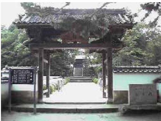
the gate of KOGETSUIN

In the area of Toshogu is an old well called UBUYU NO IDO . Matsudaira family members used the water for their baby's first bath. When Takechiyo (later Ieyasu) was born in Okazaki Castle, the water was drawn from the well, put into a bamboo bottle, and carried on a horse to the castle, miles away from there.