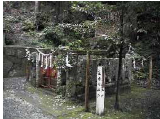
UBUYU NO IDO

This is Matsudaira Toshogu. At first it was the local shrine of the village. The moat and the stone wall were built after the Sekigahara Battle, where the two big powers, TOKUGAWA and TOYOTOMI, fought. In 1619, Ieyasu died, and the shrine was called Toshogu.