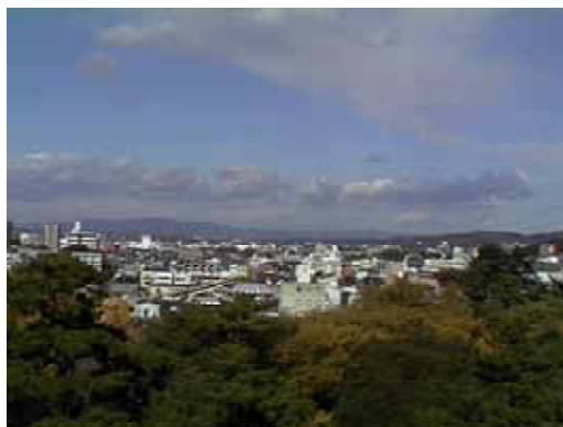
a view at the top of Okazaki Castle

Once in the Middle Ages, a monk was traveling westward from the Kanto District. He happened to come to a village deep in the mountains. He became friends with the chief and other villagers and married the daughter of the chief. He called himself MATSUDAIRA Chikauji (松平親氏), who began the MATSUDAIRA and later the TOKUGAWA (Shogun) families.