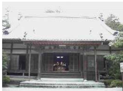
the main building of KOGETSUIN

This is Kogetsuin, MATSUDAIRA's family temple. In 1377, Chikauji constructed the statue of Amida Buddha and all the buildings and towers, and the temple was named Kogetsuin. Later, Ieyasu gave it a special territory and the TOKUGAWA Shogunate protected the temple until the Meiji Restoration. The gate and the main building were built in 1641 by command of TOKUGAWA Iemitsu, the third Shogun of TOKUGAWA.